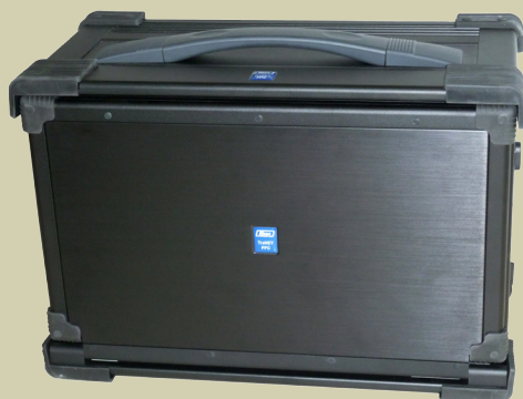
Portable, compact and robust MIL-STD 810F housing