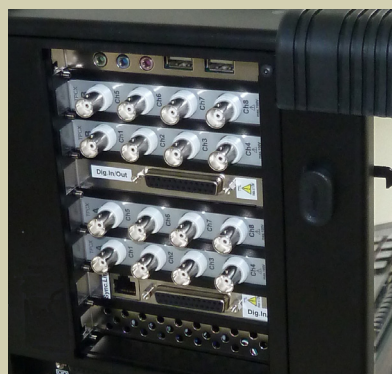
All in one Transient Recorder with very high channel density